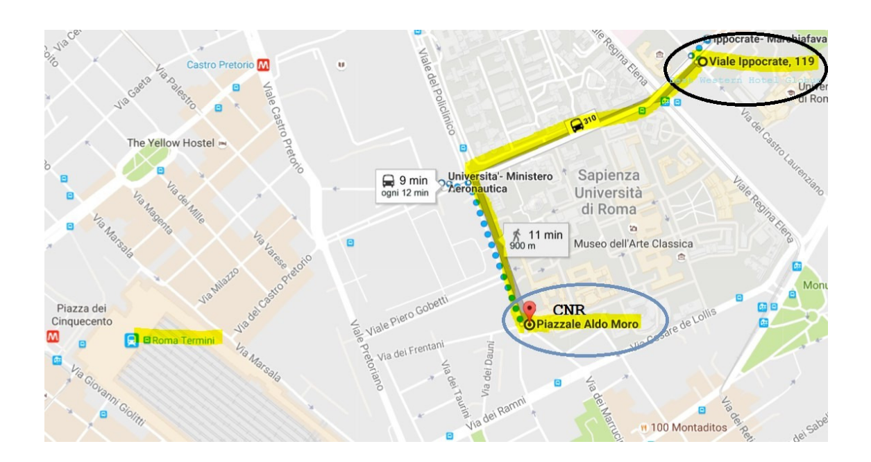
Figure 2. Directions from the Best Western Hotel GLOBUS to CNR (about 10 minutes walking)